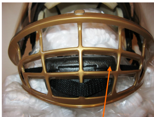
Picture 3 The chin cup assembled to the mask.