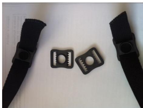
Picture 4 Straps from chin cup and snaps mount to the sides of helmet.