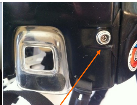
Picture 5 Male post on helmet for snapping the mask chin strap to helmet.